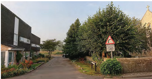
St. John's Close, Waterbeach 2021

Given the proximity to a listed building it is quite surprising that the 'modern' design of the houses in St John's Close was given planning permission as it was completely out of keeping with the setting of the listed church and Hall and the distinctive local vernacular of Station Road.